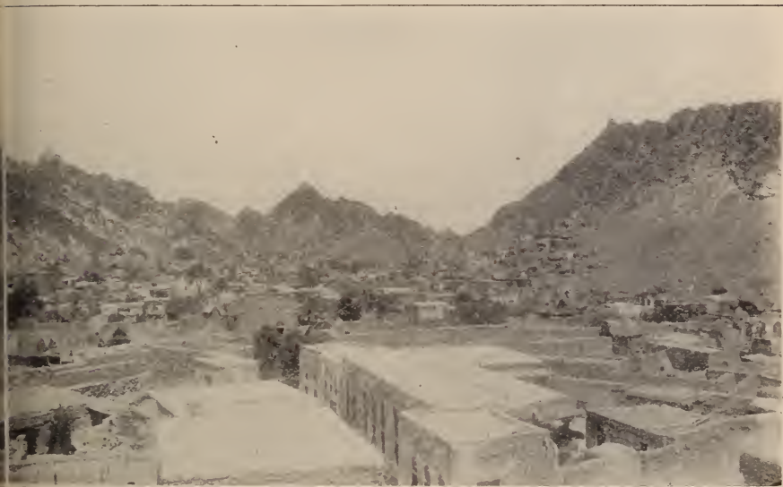
VIEW OF MUSCAT, OUTSIDE THE WALLS, LOOKING INLAND.

Our colporters at Muscat, Bahrein and Busrah made tours to the number of eighty in 1901. "They have traveled on donkeys, camels, and in native sail-boats, traversing distances which are equivalent to more than two times the number of miles between Liverpool and New York along the track of the great ocean steamers.